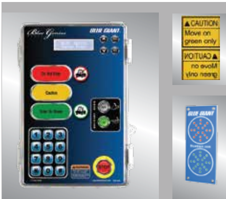
Blue Genius Gold Series I with exterior light and sign