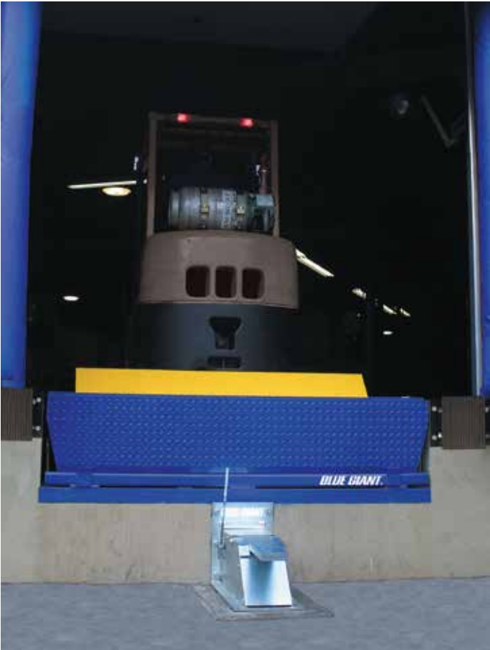
XDS 3000 shown