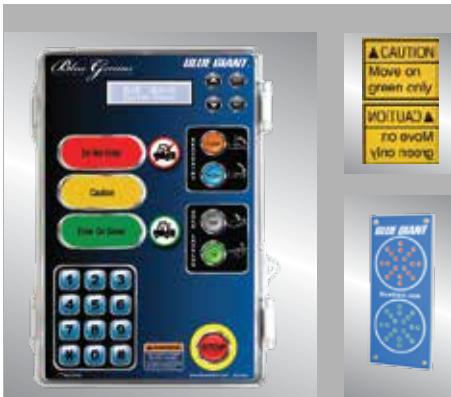
Blue Genius Gold Series III with exterior light and sign