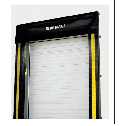
BGDSC Head Curtain Dock Seal

For maximum value and performance, the BGDSC can be constructed from our premium durability fabrics (see chart for materials, weights, and available colors).