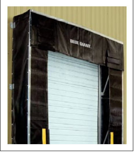
BGDSHR Retracable Dock Shelter