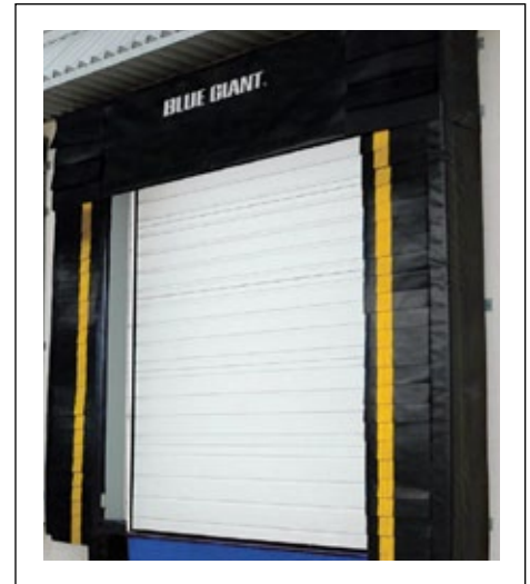
BGDSFA Full Access Dock Seal