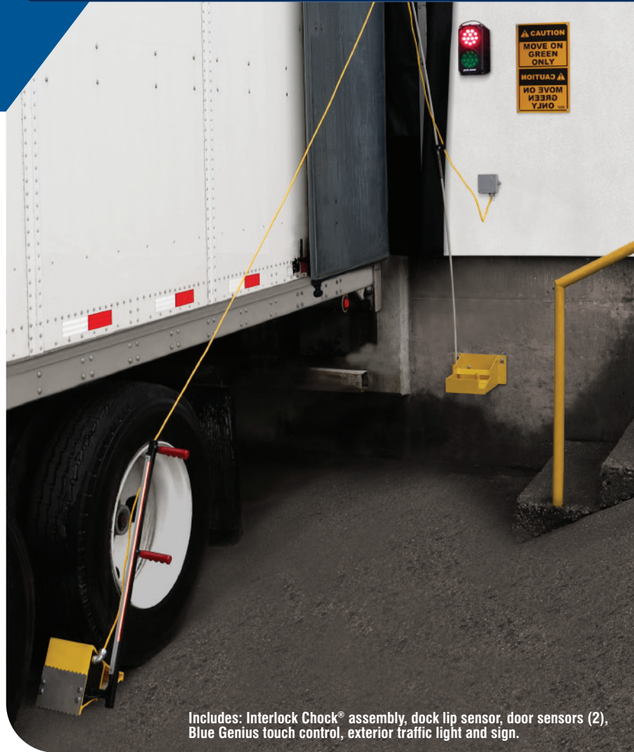
Includes: Interlock Chock® assembly, dock lip sensor, door sensors (2), Blue Genius touch control, exterior traffic light and sign.