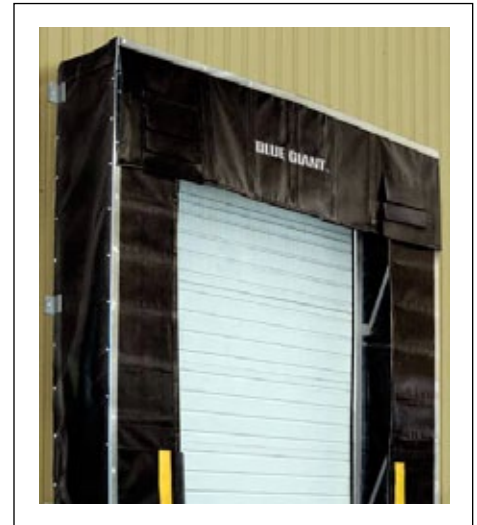
BGDSHR Retractable Dock Shelter